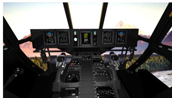
CH-47F Cockpit module shown

RVCTS-A can also perform collective training by deploying multiple aircraft platform configurations. Such versatility significantly lowers life-cycle costs while its technology innovation increases training value.